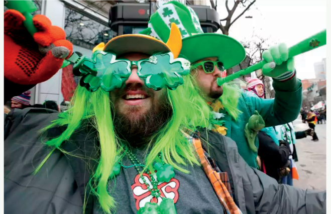
Défilé de la Saint-Patrick à Montréal le 16 mars 2019

Alors que nous nous dirigeons vers ce que nous espérons être bientôt la fin de l'hiver, une fête préférée est de nouveau là pour nous remonter le moral, quel que soit le temps : la Saint-Patrick. C'est la période de l'année où boire de la bière noire en pleine journée et marcher au milieu de la rue Sainte-Catherine ne sont pas seulement